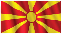
Macedonian national flag